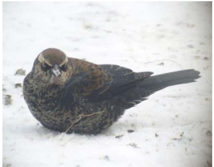
This Rusty Blackbird visited a feeder near Shelocta 12/14.