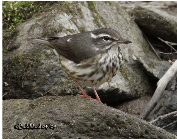
The Louisiana Waterthrush nests along Laurel Run and Little Yellow Creek at Yellow Creek S.P. but are more often heard than seen.

I have to admit that despite some trying times while birding for better than a year, there were moments when it all came together. One of those special moments occurred in August 2010. I was birding the Mahoning Shadow