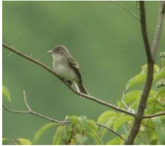
This young Willow Flycatcher was photographed at Yellow Creek.

Trail (MST), the two-mile section between the Skate Park in Punxsutawney and Cloe. This part of the trail sees the most traffic and is the noisiest section on the MST. About a quarter mile from Skate Park where the MST passes close to Mahoning Creek, Rikers rail yard is just across the creek; next to the rail yard is US Rt. 119 just outside Punxsutawney. At this location in a narrow strip of trees between the trail and the creek, with background noise of water gushing through rapids, the