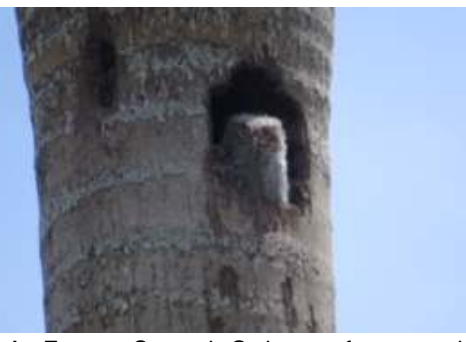
An Eastern Screech-Owl peers from a cavity in a palm.

As we got closer to Miami, we had noticed smoke from a brush fire, so we had to detour a bit as several roads were blocked off. We had lunch at Panera's before heading to Matheson Hammock Park where we once again observed the odd sight of stacked nesting holes in dead palm trees. Orange-winged Parrots, Eastern Screech-Owls, Pileated Woodpeckers, and Hill Mynas peacefully, although not quietly, shared several palm trees with the baby birds peeking from their nest holes.