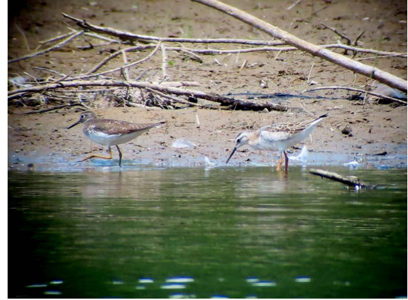
A Solitary Sandpiper and the Wilson's Phalarope were constant companions at Yellow Creek on 8/8.

After last fall's extensive mudflats and the resulting plethora of shorebirds at YC, this year's migration was disappointing. Water levels remained high at Yellow Creek this season, so little mud was exposed for migrating shorebirds. One to 2 Semipalmated Plovers were present at YC between 8/6 (JP) and 9/25 (MB, SBo, ED, MH, RH, PH, JL, KL). On 9/7 (MH, RH, DK, DM, TR) as the observers were standing at the south shore YC boat launch, a single Sanderling flew by looking for a place to land, but it was not relocated that day; we later learned it was seen and photographed the