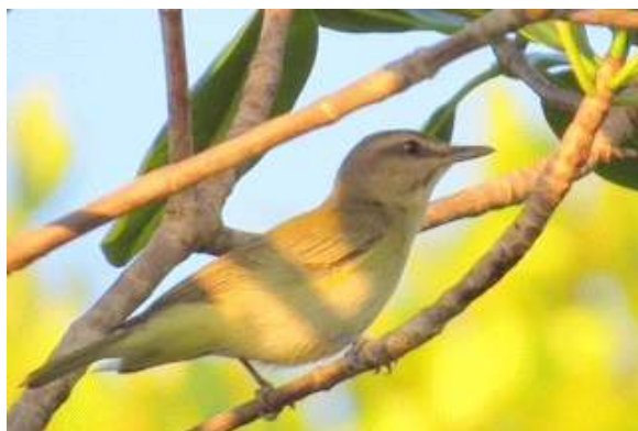
It may look like a Red-eyed Vireo, but note its black moustache which makes it a Black-whiskered Vireo.

Day 6 was Friday, April 30. We traveled to the Glenn Garrett Memorial Park to walk along one of the ditches, searching for a Smooth-billed Ani. The bird had been seen by other people, but we never did locate it. We did come across a number of Black and Turkey Vultures roosting in trees. and had the opportunity for a close comparison of the two species. I had never noticed that Black Vultures have white legs, while Turkey Vultures sport pink legs. Of course, it's not often that we get this close to them! Afterwards, we drove farther into the Everglades for a walk along the Anhinga Trail. Yes, there were numerous Anhingas here! We got a kick out of watching a vegetarian Red-eared Slider eating a spatterdock flower.