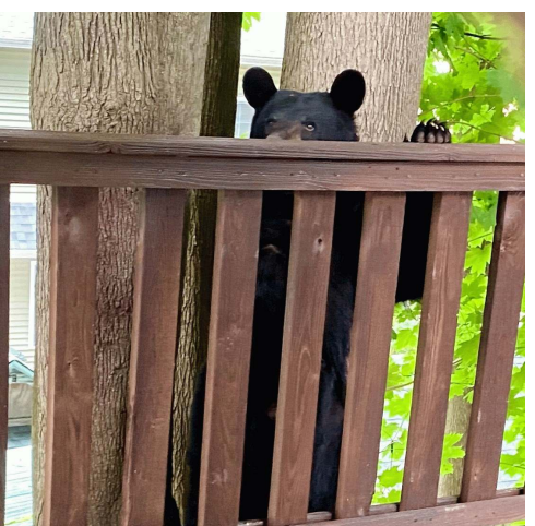
Mama Bear peers over the railing of the Glovers' back porch while her cubs are safely in the tree.

But the local area has its surprises as a large, healthy population of black bears live in the area. Bear sightings are very common. Jud, this past month, saw one casually strolling up our street in the middle of the night. Needless to say, the bears are very familiar with the town's trash cans. It is not unusual to see litter scattered about yards from a bear's visit the night before. Some bears have even figured out that trash pickups occur twice weekly in Tuxedo Park on Mondays and Thursdays. There is one local bear that makes the rounds the night before the pickups. The bear must know that is when the trash cans