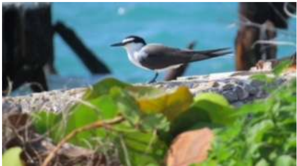
Sooty and Bridled Terns were at Fort Jefferson.