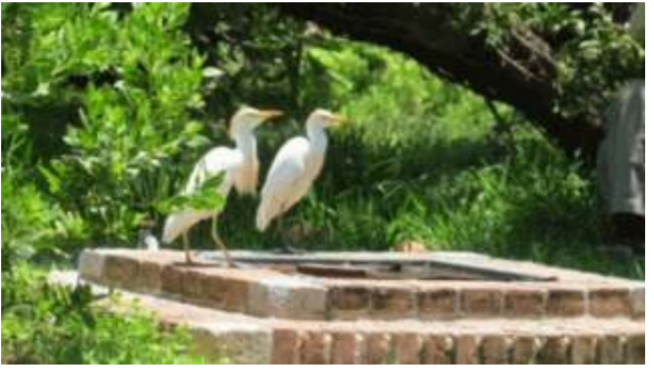
Two Cattle Egrets drink from the water.

We stopped again at the Marathon Government Center on our way back, and this time, found several Roseate Terns in among their Least Tern cousins. Some of us spotted a White-crowned Pigeon just before we pulled into the Blackfin Resort and Marina in Marathon. We would make this our base for the next two nights. After dinner, we headed for Grassy Key and parked on the side of a quiet country road. Blacknecked Stilts were feeding in the distance, and a Gray Kingbird, flirting with death, chased a Merlin out of its territory. We heard the buzzy hiccup of two Antillean Nighthawks before we saw them, and watched as they swiftly passed over us.