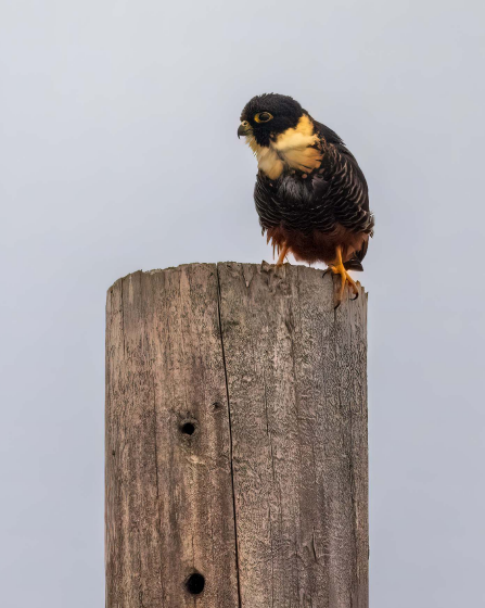
Bat Falcon

On the afternoon of December 12, a neighbor and I drove the 15 miles to Santa Ana, observing a Burrowing Owl on a water tower as we drove down. A good omen. At the refuge, we walked the road toward the hawkwatch tower where many returning birders told us they had enjoyed good views of the falcon. Other birders, leaving with smiles, advised us to continue beyond the tower where the bird was perched on a dead snag, 30 feet away.