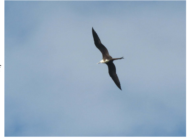
Our first Magnificent Frigatebirds flew overhead.

molting Bobolink, halfway between winter and summer plumage, was a strange combination of brown, white, and black.