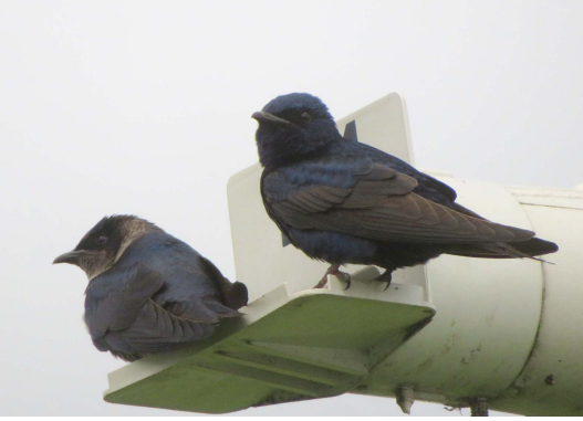
A pair of Purple Martins sit by their cavity.

time, I was not able to continue my regular nest checks because some babies were old enough that they might pre-fledge. I was concerned and didn't want to continue to lower the units. Regardless, as of the last nest check we had a total of 177 babies and eggs. We then observed several additional cavities (not in that count) that also produced babies that fledged. I'm certain we exceeded 200 fledges, but I don't have an exact number for the reasons stated.