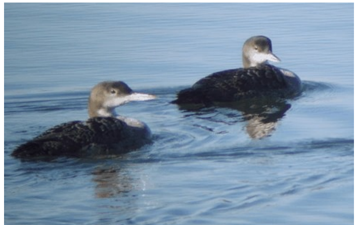
These were two of the four Common Loons that lingered at Keystone Reservoir 1/11.

Last Common Loons were one at YC 12/26 (ED,JD,JT), 4 at KR 1/11 (MH), and one at PG one week later (RB). While 33 Pied-billed Grebes used YC as a migration stop 12/10 (LC), other top counts were 8 at KR 12/11 (JS) and 10 at PG 1/3 (JS); 4 were last noted at KR 1/13 (LC,MH, GS) while 2 remained at PG 2/5 (RB); a singleton appeared at MV 2/10 (MH,RH). Two Horned Grebes were present 12/1 (GC,MH) at YC, the region's lone report.