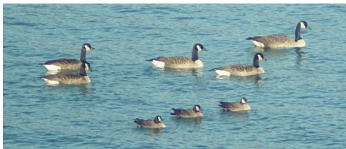
Note the three smaller, shorter necked Cackling Geese in front of the five Canada Geese photographed at Keystone Reservoir 12/10/2006.

Canada Goose maxima included 142 at PG 12/4 (RB), 214 at KR and 320 at YC 12/10 (LC), an even 1200 on the IN CBC 12/26