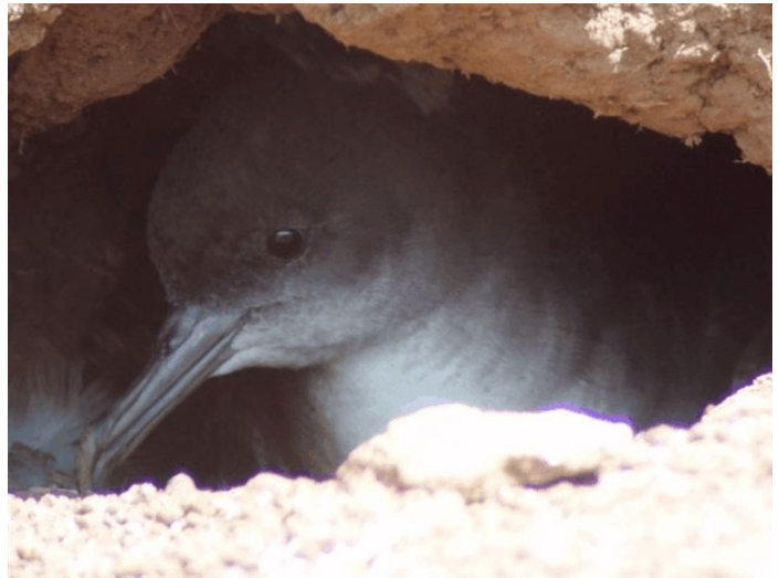
This Wedge-tailed Shearwater was nesting in a burrow right along the walkway at Kīlauea Point.

Our next destination was Hanalei National Wildlife Refuge where our list included Hawaiian Ducks, Black-crowned Night-Herons, Common Moorhens, Black-necked Stilts, and Pacific Golden-Plovers. A stop at Haena State Park yielded hundreds of Black Noddies, yet another life bird. Near Hanalei we spotted a Western Meadowlark. On our way back to the motel we stopped in Kapa'a for dinner at the Wahoo Seafood Bar and Grill; we voted this the best meal of the trip. Tomorrow we would drive back to Lihū'e to fly to the Big Island.