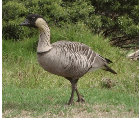
The Hawaiian Goose is Hawaii's state bird.

We flew from Honolulu to the island Kaua'i early in the morning, landing in Lihu'e. The short 37-minute flight was on a plane much larger than the express jet between Pittsburgh and Houston. At the airport Red Junglefowl, Red-crested Cardinals, and House Sparrows were immediately apparent. We picked up our rental car and headed westward on Route 50 toward Kōke'e State Park in Waimea Canyon. It seems like there are a lot of "Waimeas" in Hawaii.