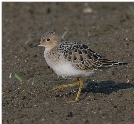
Buff-breasted Sandpiper is just one of the many shorebirds that use the Conejohela Flats as a migration stop.

Tuesday, June 12 – Yellow Creek State Park Pontoon Trip, led by park naturalist, Mike Shaffer. Meet at the boat rental on the south shore in the main day-use area at 4:00