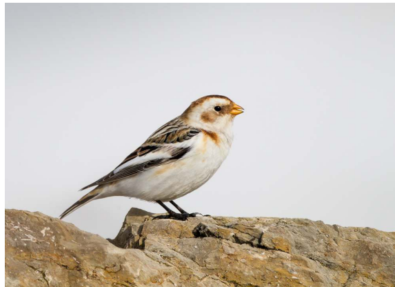
Bob photographed this beautiful Snow Bunting at Conneaut Harbor on February 18, 2013.

Todd Bird Club meetings begin at 7:00 p.m. the first Tuesday of the month, September through April, at Blue Spruce Lodge in Blue Spruce County Park, located just off Route 110 east of the town of Ernest. We will socialize and snack till 7:30 when the meeting will be called to order. Refreshments are provided at each of our meetings. In May we hold our banquet meeting which starts at 6:00 p.m.