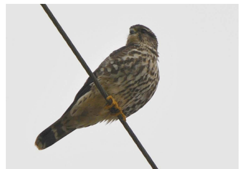
Marge Van Tassel captured this shot of a Merlin near Worthington 2/9.

An immature Red-headed Woodpecker , that had arrived at Ford Cliff last October, remained through the end of the season (JR, LR); the bird's head progressively gained more red as time passed. Lynn writes: "That bird was all over our property all winter until the last couple of weeks when he staked out a great nest cavity in a big black oak near our garages and began spending almost all of the daylight hours around the cavity. Lots of calling and hopping around near the hole. I guess nobody responded and the bird left." An adult Red-headed Woodpecker near SH on WRS #3 on 1/11 (MH, RH, DL) was a nice surprise. Yellow-bellied Sapsucker sightings included one n. of IN 12/13 (SB), 2 on the CBC 12/28 (v.o.), one eating suet near Homer City 1/14 through the end of the period, and a visitor to black oil sunflower seed at Nolo 1/22-26 (CL, GL).