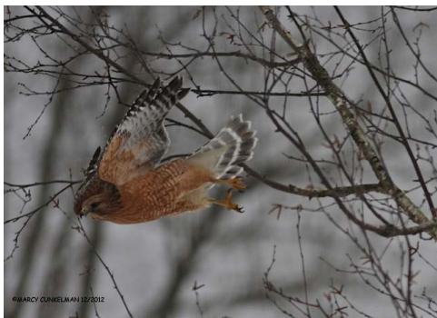
A Red-shouldered Hawk visited Marcy Cunkelman's yard near LV on 12/30.

An early Turkey Vulture was noted 2/13 (MC) near LV. Bald Eagle reports mentioned one at PG 12/15, 1/30 (JS), 2 at KR 1/10 (ErD), and 2 at CC on several dates (v.o.); 4 Bald Eagles were reported at Conemaugh Dam 2/17 (TL); Indiana's first Bald Eagle nest was found this year (NK) at an undisclosed location as these eagles are very sensitive to