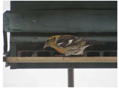
Cindy Rogers photographed this rare visitor at her feeder on East Pike.

Common Redpolls were widespread with top counts of 37 near IN 1/29 (DJ), 40 near Patton 2/2 (DG), 48 near LV 2/13 (MC), 38 near South Bend 2/15 (MH, RH), and 46 n. of IN 2/16 (SB); other reports included 5 near Brush Valley 1/3 (PA), one near Nolo 1/4 (DB), 4 at Nolo 1/8 (CL, GL), one at Blue Spruce 1/18 (EP), 6 at Rural Valley 1/22 (SL), 2 near Rural Valley 1/26 (CH), 4 in IN 2/6 (TS), 25 near IN 2/7