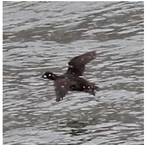
Dan Yagusic found this first-year drake Harlequin at Freeport. It was seen by many birders.

Nine Canvasbacks lingered at YC 1/1 (LC, TG, MH, RH). Four Redheads arrived at YC 12/28 (GL, GS), and 3 remained through 1/1 (LC, TG, MH, RH); the first 2 returning Redheads arrived at Parks Industrial Park 2/13 (MVT). January 1 (LC, TG, MH, RH) produced the last 9 Ring-necked Ducks at YC while RT yielded the first 3 on 2/15 (MH, RH). One to 4 Greater Scaup were noted at YC on five dates between 12/3 (LC) and 12/13 (TA, LH). Eleven Lesser Scaup 1/1 (LC, TG, MH, RH) at YC were last; 2/15 yielded 16 returnees at PG (JS) and singletons at CC (LV) and RT (MH, RH). An immature male Harlequin Duck at Freeport, found 2/10 (DY et al ), was the first Armstrong record; this bird remained through the end of the