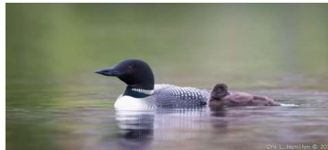
Cris Hamilton photographed these Common Loons on a kayaking adventure.