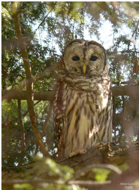
Steve Gosser photographed the Barred Owl at Crooked Creek.

Last Eastern Wood-Pewees included birds along Crooked Creek 9/20 (MVT), at YC 9/21 (ST), and at PG 9/29 (PJF). BS produced the season's only 2 Yellow-bellied Flycatcher sightings 9/11, 18 (MH, RH) as well as the last calling Acadian Flycatcher 9/26 (MH, RH).