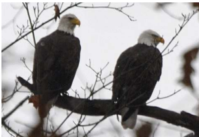
Marge Van Tassel photographed this pair of Bald Eagles at Crooked Creek 11/17.

11/9 (LC, MH, RH). A Lesser Yellowlegs was first seen at CC 8/5 (MVT); 2 appeared on 8/9 (LC) at YC where 4 late birds were noted 11/3 (DJM). A Ruddy Turnstone that appeared in Little Yellow Cove 9/3 (LC, TG, MH, RH, ML) was unexpected. Seven Dunlin arrived 10/22 (LC, TG, MH, RH) at YC; 2 were heard nocturnally in Indiana 10/29 (DL); high counts included 22 on 11/1 (LC) and 18 on 11/5 (LC, TG, MH, RH); last were 16 on 11/7 (LC). A Baird's Sandpiper arrived right in front of the observers as they