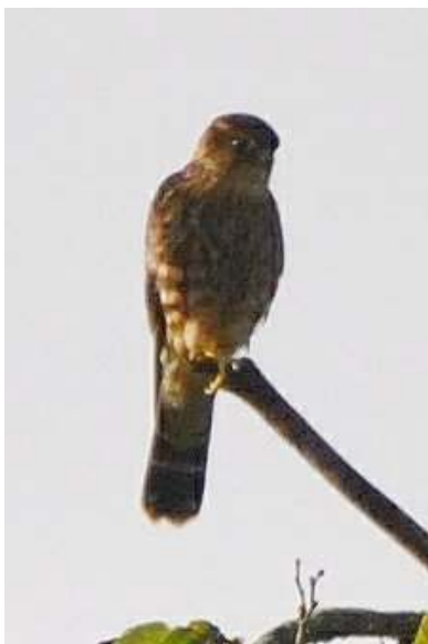
This Merlin visited Crooked Creek Park 8/9 and was photographed by Marge Van Tassel.

Last Ruby-throated Hummingbirds included one near SH 9/13 (MH, RH) and another near Lewisville 9/30 (MC). September 26 (PJF) produced the first migrant Yellow-bellied Sapsucker sighting at Patton while YC's first was sighted two days later (LC, MH, RH, GL); on 10/2 there were 4 at BS (MH, RH) and one near LV (DC, MC); Saylor Park yielded 3 on 11/16 (TG, MH, RH, IG, DN).