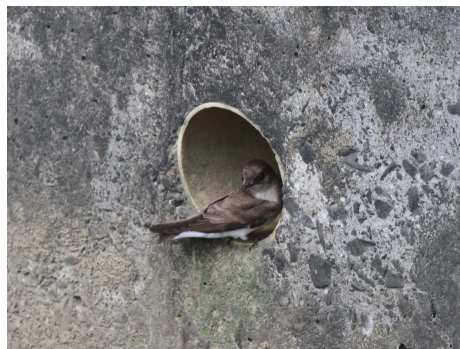
This is one of the Yellow Creek swallows nesting in the drain pipe