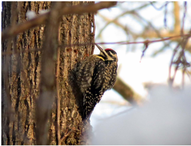
One of many reported Yellow-bellied Sapsuckers, this one was photographed at Conemaugh Dam 12/14.

A WRS yielded the first Turkey Vulture 1/25 (TG, MH, RH, GL); this, too, is only the third January record in Indiana for this species. By 2/23 (DL) 35 were tallied along East Pike and on 2/27 (JH) 33 were counted in the same area. Among the many Northern Harrier reports, four WRS routes in Indiana and Armstrong yielded a total of 9, all of which were either immatures or females. Other reports included one near Smicksburg Cemetery 12/1 (DM, EM) and adult males west of Kittanning 2/15 (RN) and near Patton 2/26 (RL). The Worthington area yielded 3 individuals 1/1 (MVT) as well as numerous other reports of 1-2 harriers (v.o.). Another harrier frequented fields