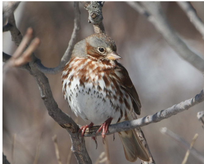
This is one of the Sandy Hook Fox Sparrows.

We enjoyed dinner at a Panera's and spent the night at a Super 8 in Asbury Park. Friday morning dawned clear and cold, with temperatures in the 30s, and the wind seemed to have died down a bit. We grabbed coffee and a quick breakfast at the motel then headed north once more, pausing briefly at Deal Lake and Lake Takanassee. A stop at Seven Presidents Park was my first visit there, and I was tremendously impressed by the large, heated restrooms! Black Scoters, Red-breasted Mergansers, and Red-throated and Common Loons could be seen in the ocean. Two Northern Mockingbirds were loudly announcing their presence, and we caught a quick glimpse of a Yellow-rumped Warbler.