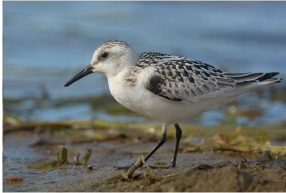
Steve Gosser found and photographed this Sanderling at Yellow Creek on 9/15.

Two Long-billed Dowitchers were observed at YC 10/2 (LC, MH, RH), 10/4 (LC, RC, TG, MH, RH, DK, GL, KT) and on 10/7 (AK, JK); this is the 6 th county record. A rather late American Woodcock was flushed at YC 11/22 (LC, ED, MH, RH, DK). Last Spotted Sandpiper was photographed at CC 10/19 (AK, JK). Top counts of Solitary Sandpiper were 4 at CC 8/6 (ABu) and at Wilmore Dam 8/18 (JS), 7 at YC 8/9 (LC, ED, TG, DK,