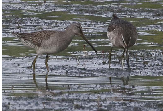
Roger Higbee photographed these two Long-billed Dowitchers at Yellow Creek on 10/4.

KT), and 4 at KR 8/12 (SG); a singleton at YC 10/11 (LC, RC, PF, MH, RH) was last. Listed only at YC, Greater Yellowlegs peaked at 6 on 10/18 (RN), when the observer watched one eat a small frog. More widespread, Lesser Yellowlegs reports detailed 7 at CC 8/7 (TR), one at KR 8/12,20 (SG), and 1-3 at YC 8/7 (TH) through 10/18 (PF).