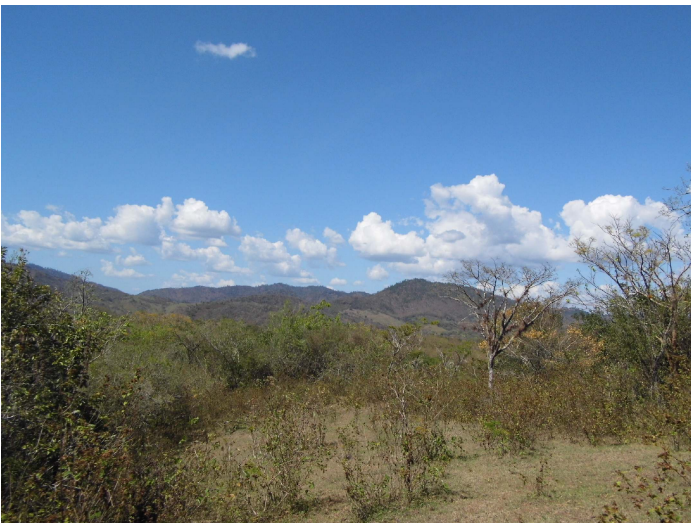
This photo depicts the dry thorn forest habitat required by the Honduran Emerald.