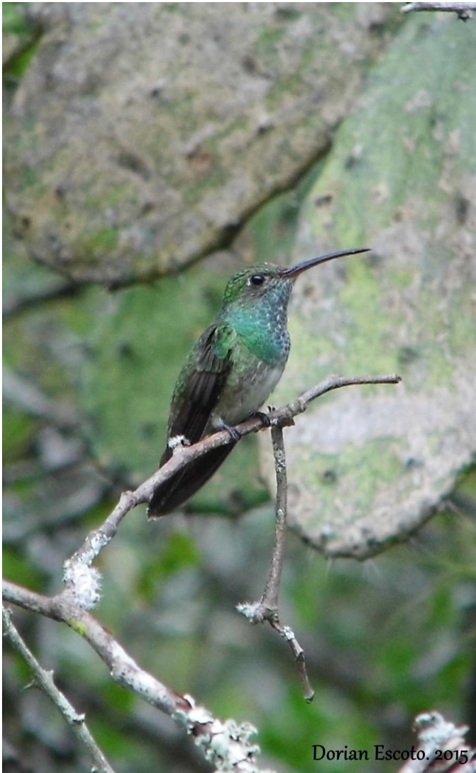
Dorian Escoto, 2015