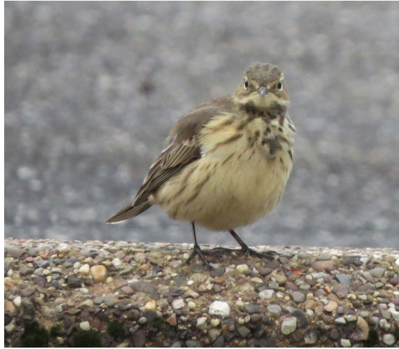
An American Pipit stopped at Crooked Creek Park 9/29 where Marge Van Tassel got this shot.

Single Olive-sided Flycatchers visited a yard near LV 9/9, 10 (MC) and YC 9/13 (RC, MH, JT) and 9/14, (DR). An Eastern Wood-Pewee , our latest Oct. record, was reported at YC 10/9 (TA). Two Yellow-bellied Flycatchers were listed at BS 8/29 (MH, RH) where one was found 9/10 (SG). A Least Flycatcher noted at YC 9/27 (DK) is the latest on record for Indiana .