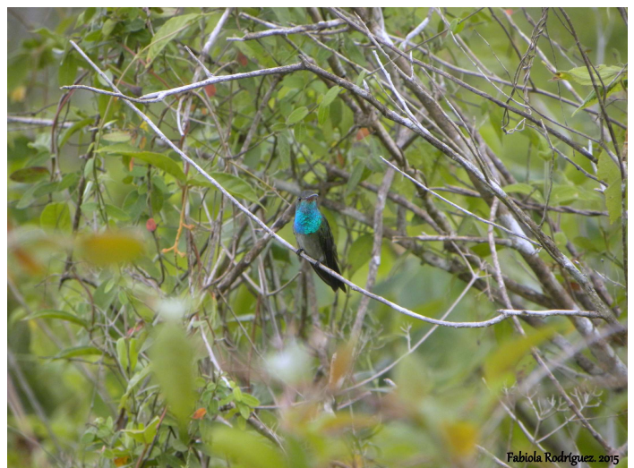
Fabiola Rodriguez, 2015