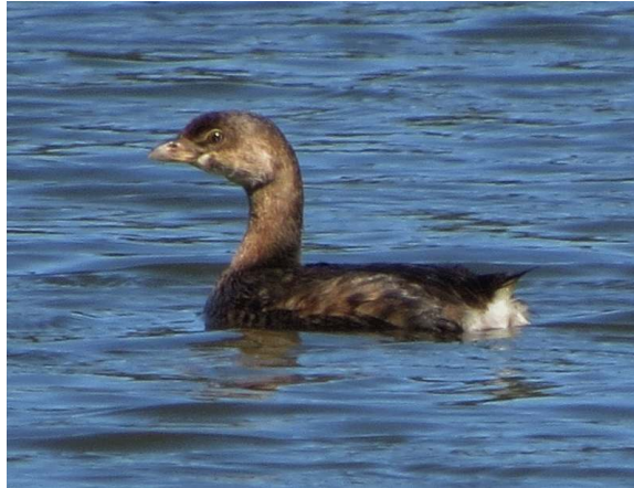
Marge Van Tassel photographed this Pied-billed Grebe 9/27 at Crooked Creek.

A lone Mute Swan was present at YC from 8/30 to 11/30 (v.o.); not commonly seen in the county, the previous report of one occurred March-May 2012 (v.o.). Unusual were only three reports of Tundra Swans in the region; 8 were sighted over BS 11/11 (MH, RH), 5 at Margus Lake 11/21 (CL, GL), and 14 at YC 11/25 (AS). In past years Tundra Swans were much more numerous during the fall migration.