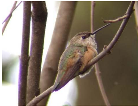
Greg Tomb photographed this Rufous Hummingbird near Seward 9/25.

Eastern Screech-Owls were noted at 3 Armstrong , 4 Indiana , and one Cambria location; Great Horned Owls , at one Armstrong , 4 Indiana , and 3 Cambria sites; and