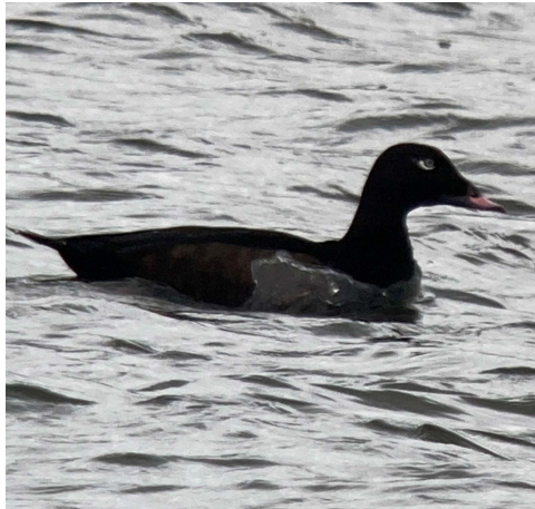
This White-winged Scoter, was a great find on the last day of the Fall Migration Round-up at Yellow Creek.

For starters, we hope to showcase how valuable PA State Parks are for conservation, in this case for birds. Whether